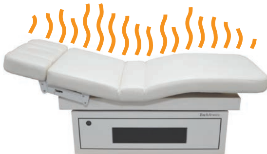
Fully integrated heating

Contact TouchAmerica's sales team to learn more about tailored sheet sets for the MESA.