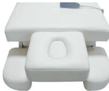
Hydraulically-adjustable face support