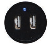
Convenient USB connectors built in