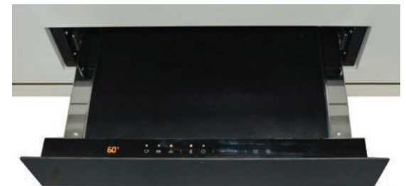
Optional warming drawer shown. Currently only available with 220 Power